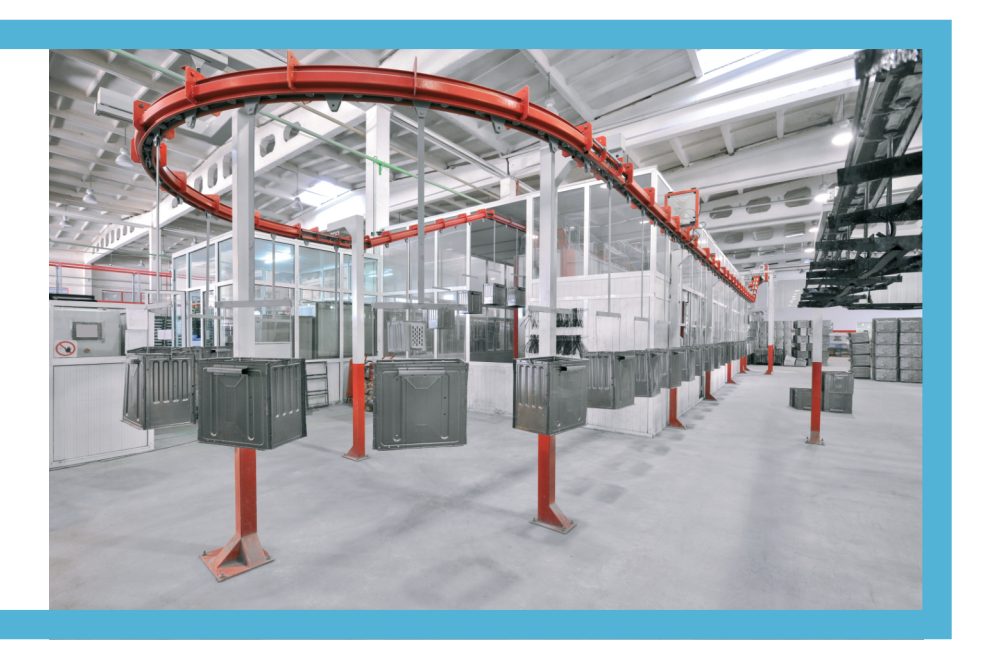
The cooking chambers are coated fully automatically with glass ceramic powder by a painting robot and then cured in an oven at temperatures of 850°.

Added to this is wear and tear in daily use. The coating must be easy to care for, scratches and knocks should have no consequences, and somewhat rough cleaning methods must not cause any damage.